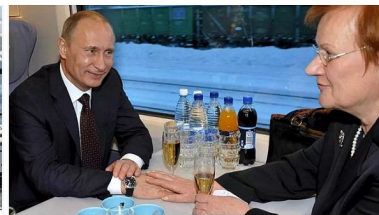
Presidentti Tarja Halonen ja silloin Venäjän pääministerinä toiminut Vladimir Putin matkustivat Allegro-jumalla joulukuussa 2010.