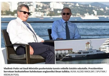
Vladimir Putin vei Sauli Niinistön puolentoista tunnin reitille Setelien edustalle. Presidenttien kerrotaan keskustelleen kahdestaan englanniksi ilman tulkia.